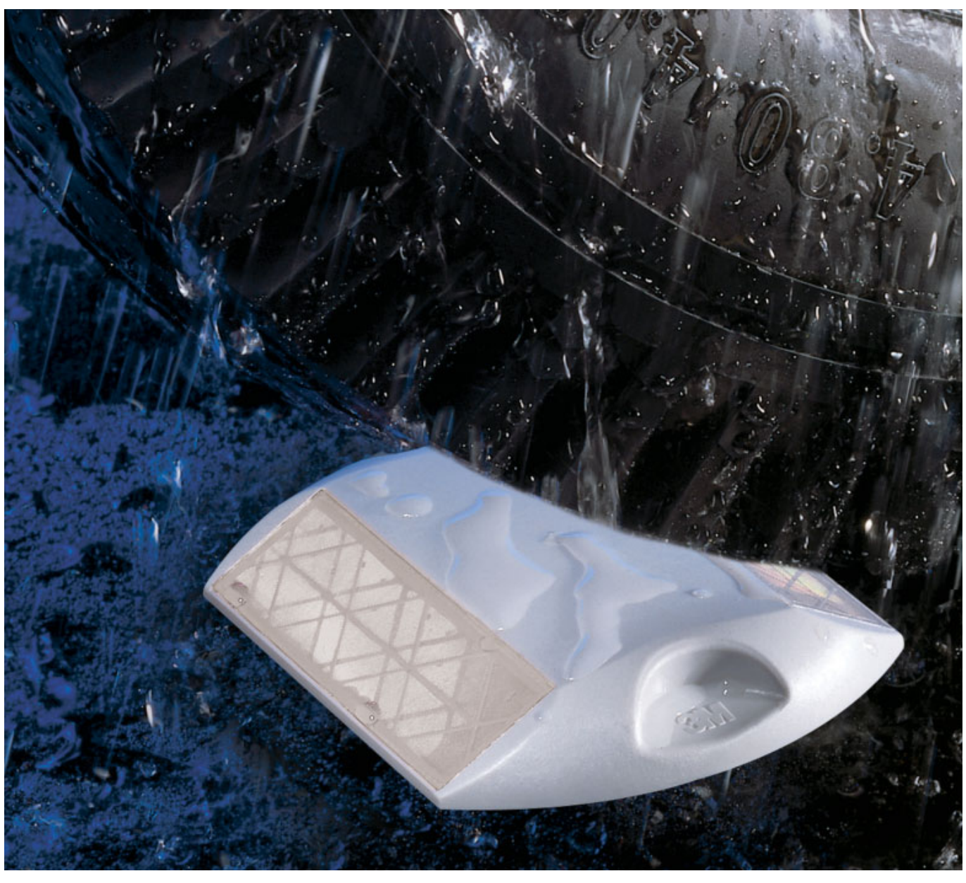
√quality √durability √performance